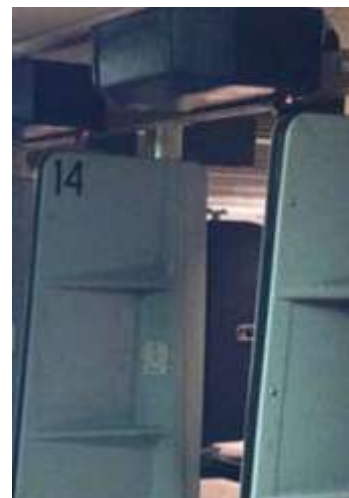
Have you thought about coming down to Anthony Arms for a party or afternoon?

You have our permission to take credit for negotiating this service for your event attendees. Believe me; they will thank you for it.